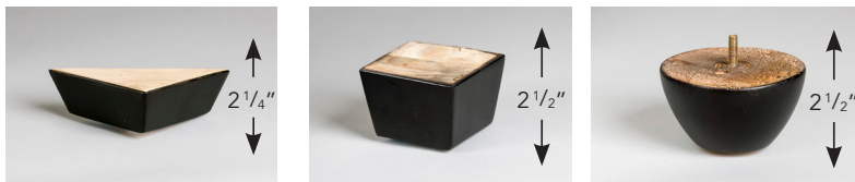
Wedge - W