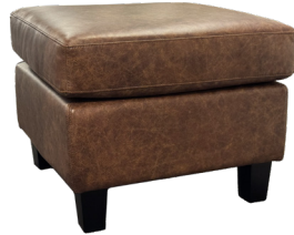
B - Square