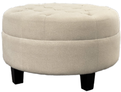
A - Round