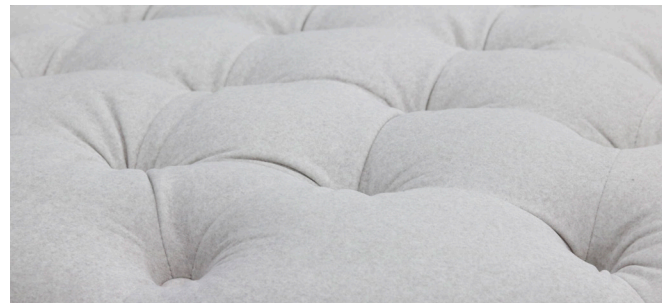
G - Tufted