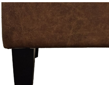
H - 5" Tapered Leg