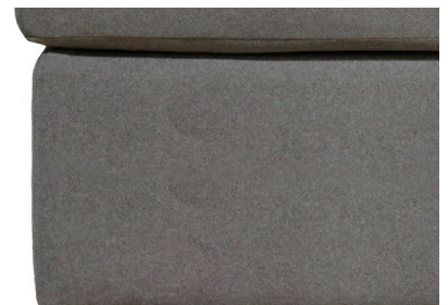
J - Box Base**

** Box Base is only available for storage ottoman.