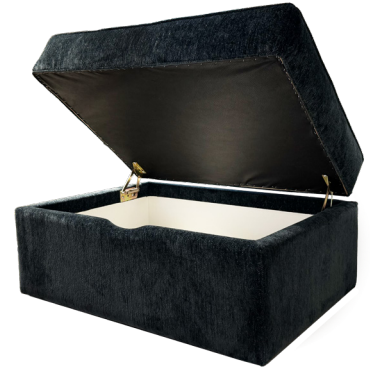
D - Rectangle (with storage)

* Storage Ottoman is only available with Rectangle shape