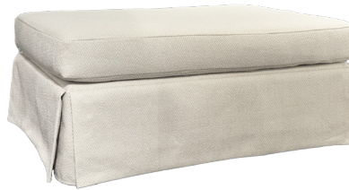
C - Rectangle