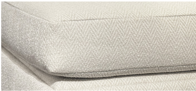
F - Box Top